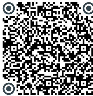
CCMA Item Request Form