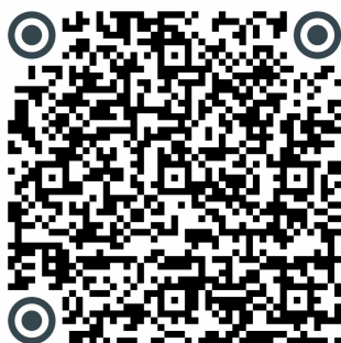
CCMA Fund Request Form